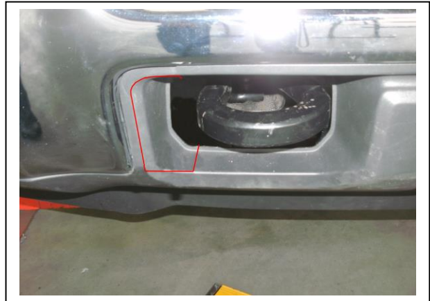
Figure 2: Red Line is cut line. Drivers side shown